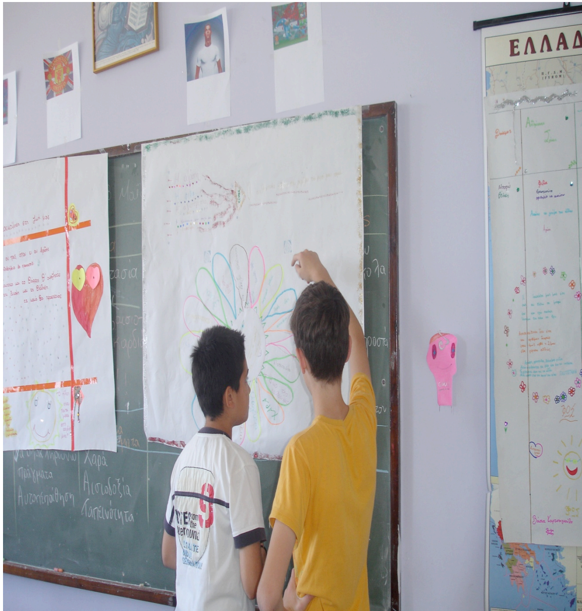
(Vision 2: "Together we compel the petals of the soul to open" 2nd Step- Lyrics to the cycle of evolution)